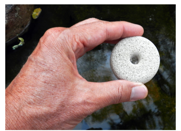
Mosquito Dunks<sup>®</sup> contain BTI, a bacterium that kills mosquito larvae. Just place a Mosquito Dunk in any standing water for 30 days of protection against mosquito larvae. Mosquito Dunks<sup>®</sup> are biodegradeable and are approved for organic use.

kill mosquitoes without harming beneficial insects, birds and other wildlife, pets and even humans."